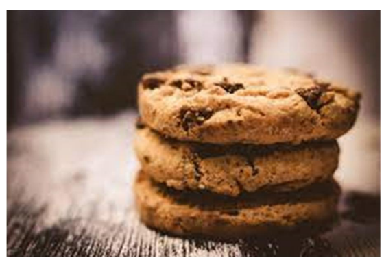
Fig. 9: Gluten-free cookies.