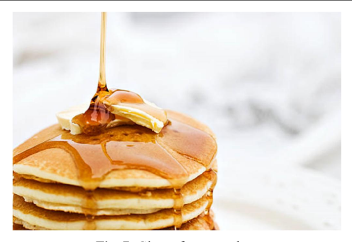
Fig. 7: Gluten free pancakes.