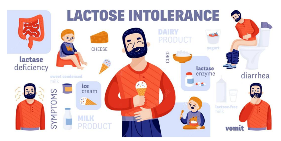
Fig. 4: Lactose intolerance symptoms.

The symptoms of lactose intolerance are not so different from that of Gluten intolerance. The reaction may occur immediately within minutes after the child eats or drinks products that contain lactose, or it could take several hours and even days for the symptoms to start visualizing on your child after consuming meals rich in lactose. Some of these symptoms may include: Diarrhea, Vomiting, Skin Rash, Extreme Fussiness, Low/No weight gain, Gassiness, Blood in stool, Spitting up (Lactose Intolerance, 2021).