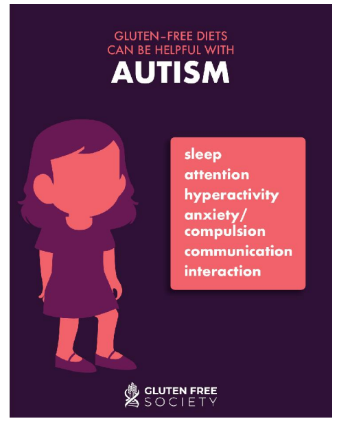
Fig. 2: Gluten-free diet helpful against AUTISM symptoms.

Although there isn't enough evidence to suggest that everyone with autism should follow a gluten- and casein-free diet, some people claim to feel better when they do. When following a gluten- and casein-free diet, every food that contains either of these proteins must be avoided. A diet devoid of casein and gluten carries some risk. The gluten-free diet (GFD) has been demonstrated to reduce the behavioral and intellectual problems associated with ASD, and epidemiological studies have also indicated a connection between ASD and celiac disease. (Croall et al. , 2021).