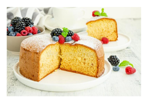
Fig. 6: Gluten Free Sponge Cake.