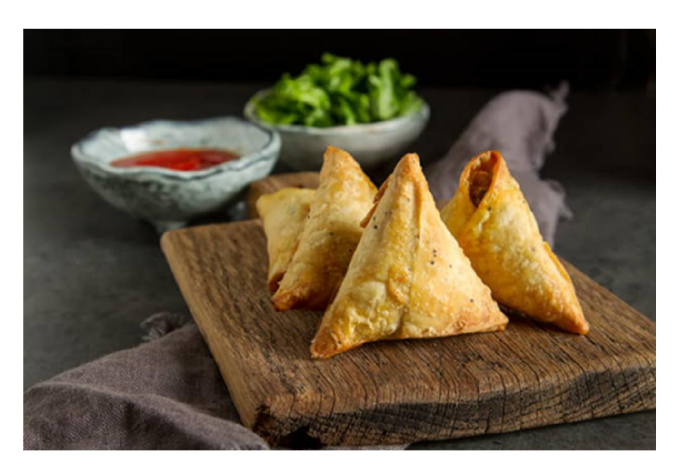
Fig. 8: Gluten-free samosa.