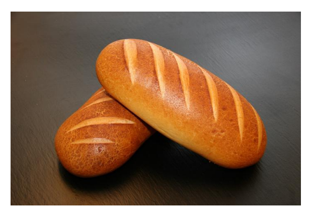
Fig.11: Lactose free bread.