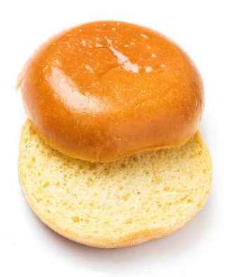
Fig. 10: Gluten-free burger buns.