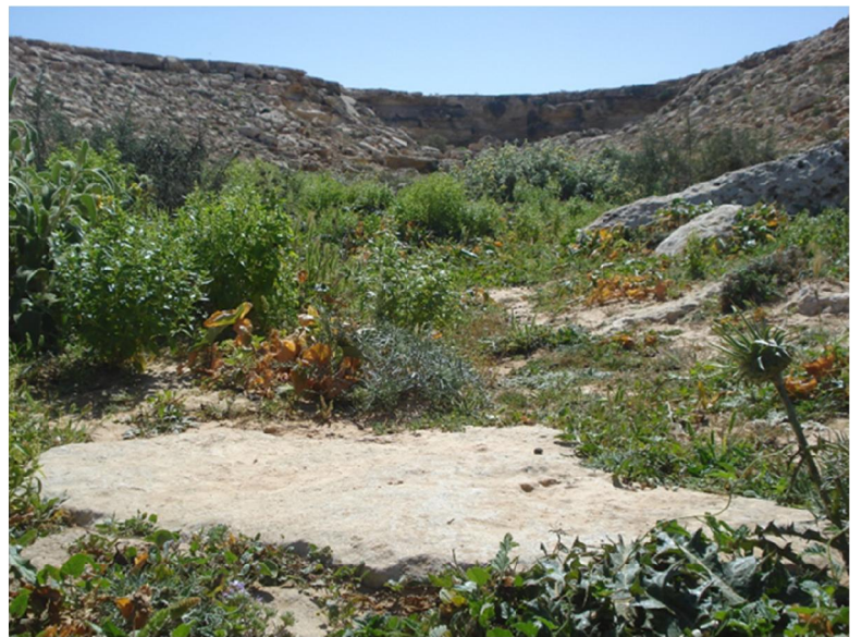
Fig. 2: Wadi Halazein at 45km west Mersa Matrouh in Egypt

the warmest month. The average high temperature during winter fluctuated between 18-20 °C, the average temperature is 13.1 °C in January.