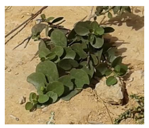
Fig. 1: Capparis spinosa L. var inermis Turra

Arial parts of Capparis spinosa L. var. inermis plant were collected from Wadi Halazien,45Km west Mersa Matrouh, Egypt in January 2018 and July 2018 (Figure 1). The plant was authenticated and identified In the Herbarium of Desert Research Center.